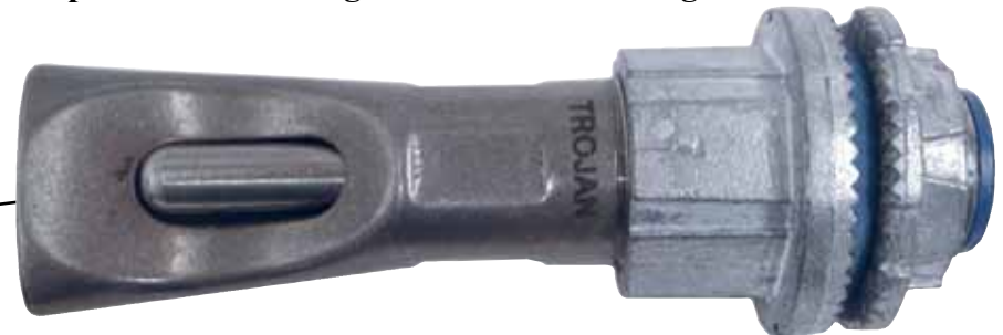
Model 95 Oval Duct

Watering Efficiency that makes a Real Difference.